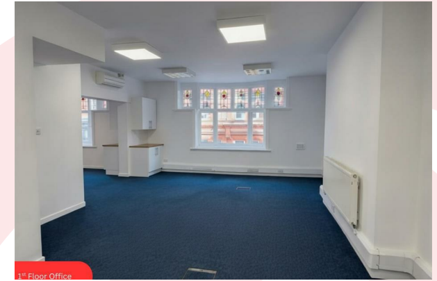
1st Floor Office

Please contact us on 0161 773 3978 if you wish to arrange a viewing appointment for this property or require further information.