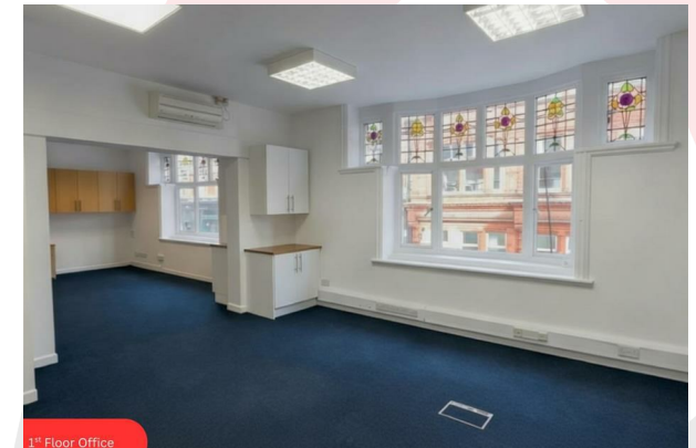
1st Floor Office