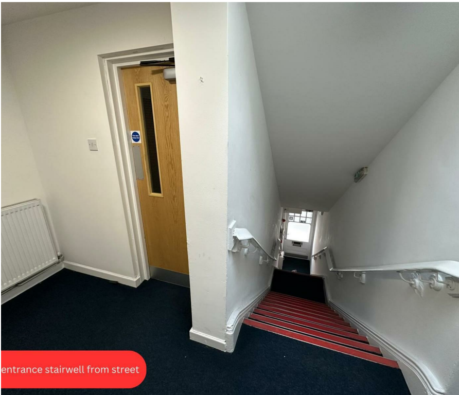
Entrance stairwell from street